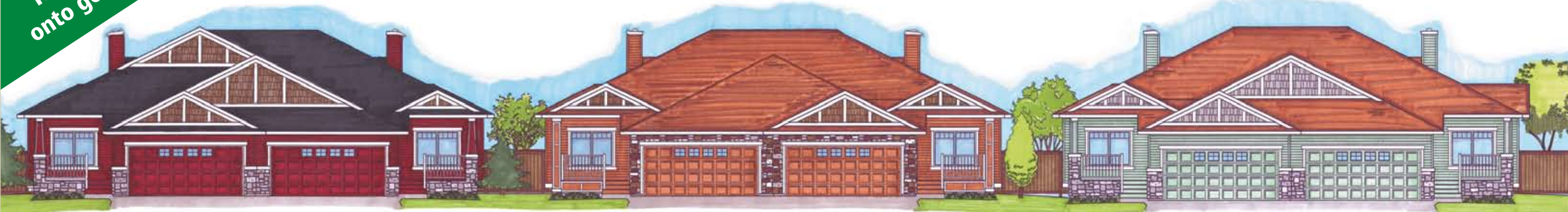
129 SPEARGRASS CIRCLE