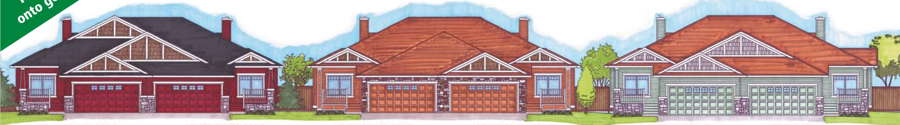
129 SPEARGRASS CIRCLE